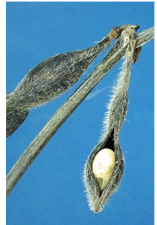
Figure 1. Soybean seed beginning to swell from moisture available through pod wall.