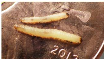
Figure 1. Corn rootworm larvae.

In all areas of the Corn Belt, production practices that favor growth in CRW populations include, continuous corn rotations, late-planted corn fields, and/or the planting of late-maturing corn products for the area. For example, full season products used by many silage growers are often prime targets for escalating CRW beetle populations because they pollinate when other desirable adult CRW food sources have deteriorated.