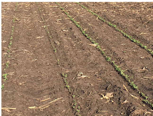
Figure 2. The two rows on the left are untreated, the two rows on the right are treated with Acceleron® Seed Applied Solutions STANDARD.