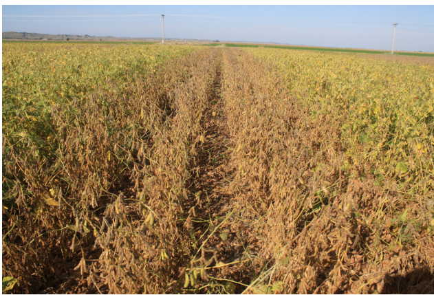
Figure 2. Image of the 2.0MG product in the +Boron fertigation treatment.