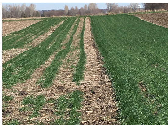
Figure 1. Field picture showing the established cereal rye cover crop used for the trial. Dense vegetation on the right is the early established cover crop and the sparse vegetation on the left is the late established cover crop. Picture was taken just before soybean planting.